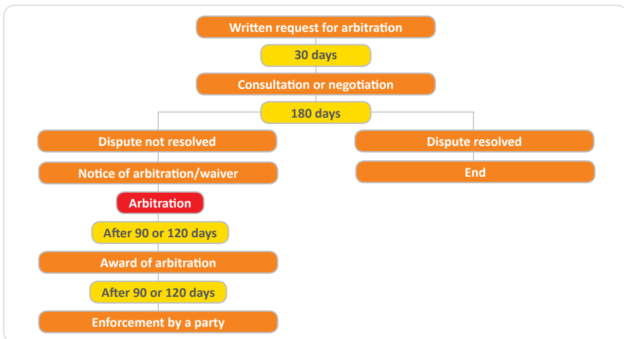
TABLE 6: Summary of dispute resolution proceedings under ACIA

An investor from an ASEAN Member State was granted a license, by another ASEAN Member State, to carry a particular business activity on its territory as a foreign investor. Such license was later canceled without cause and without an appropriate compensation by the host state. The investment contract signed by the parties does not provide a dispute resolution mechanism. However, in some cases, the withdrawal of a license may constitute a violation of the host state obligations under the ACIA and allows the ASEAN investor to benefit from the investor-state arbitration procedures provided in the ACIA.